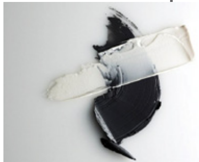
JUDO PANTS AND BAG PROJECT